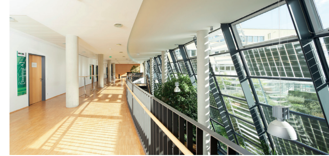
ETAGE Innenansicht