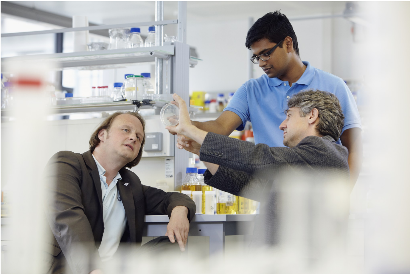
Interdisciplinary study and research programmes give students training beyond rigid disciplinary borders.

specific temperature or for a specific substrate.