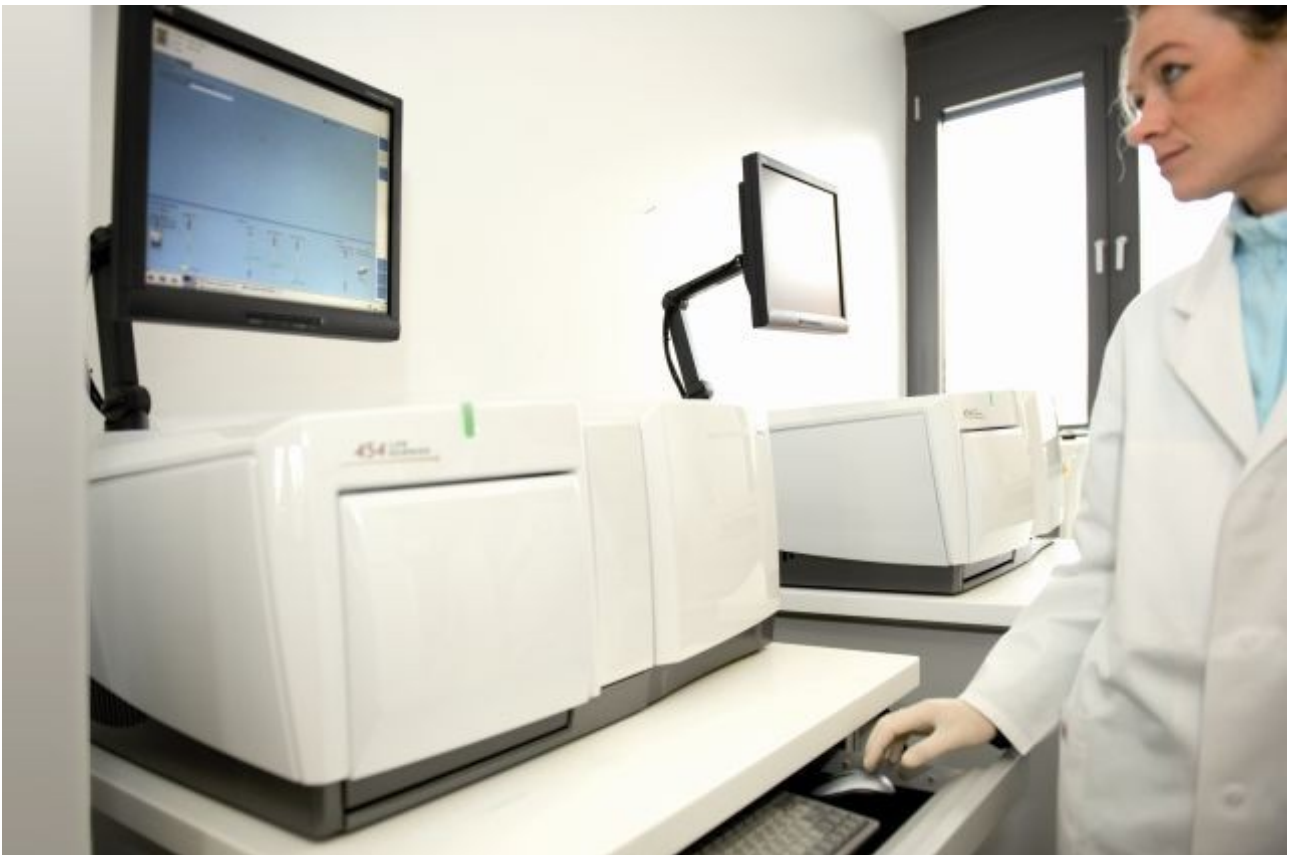
Laboratory assistant analyzing data on a computer.

Data mining can be of economic, medical as well as organizational value for all parties involved in the healthcare sector. Data resources in hospitals and clinics can be used as a basis for financial and internal controls, medical process management and risk identification. Various data mining methods and processing models are able to transform data into useful information for professional interpretation and decision-making. Information obtained with data mining methods, based for example on comparative data from medical analyses, can also help physicians in the prevention and diagnosis of disease as well as in patient therapy and care.