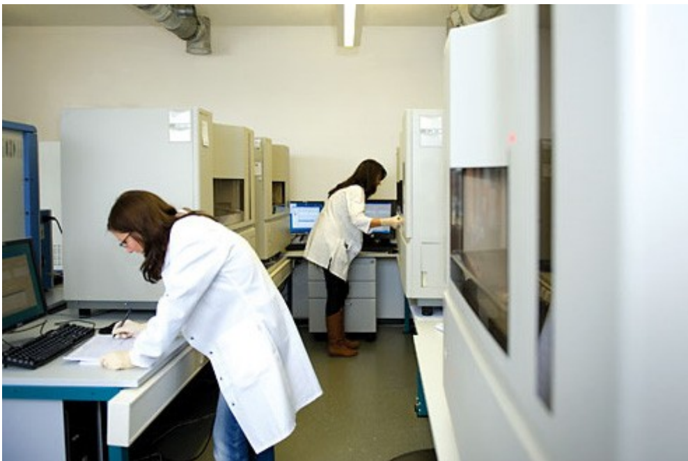
These days, people often share their workplaces with huge, computer-controlled equipment.

Research and healthcare activities produce huge quantities of data that need to be presented in an understandable structure. This requires computer-assisted extraction of relevant data and the use of statistical methods. This process, known as data mining, enables the discovery of patterns in large data sets. Data mining methods are of particular importance in fields that use high-throughput methods, visualisation methods and telemedical applications.