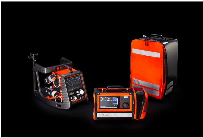
The CARL technology includes the CARL controller, CARL MOX for O 2 and CO 2 control and the CARL COOLER cooling unit.