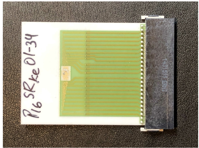
eNose consists of a chip with 16 individual sensors with tin dioxide nanowires.