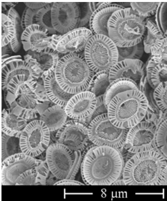
The marine algal species Emiliana huxleyi produces finely structured lime platelets that could be used for technical applications.

In addition, the algae have the great advantage that they can be kept in an environmentally friendly way in bioreactors – as if they were on a green field. They only need light and some nutrient medium, they are uncomplicated and willingly incorporate all sorts of elements.” The researchers are still looking for ways to finance this recycling project.