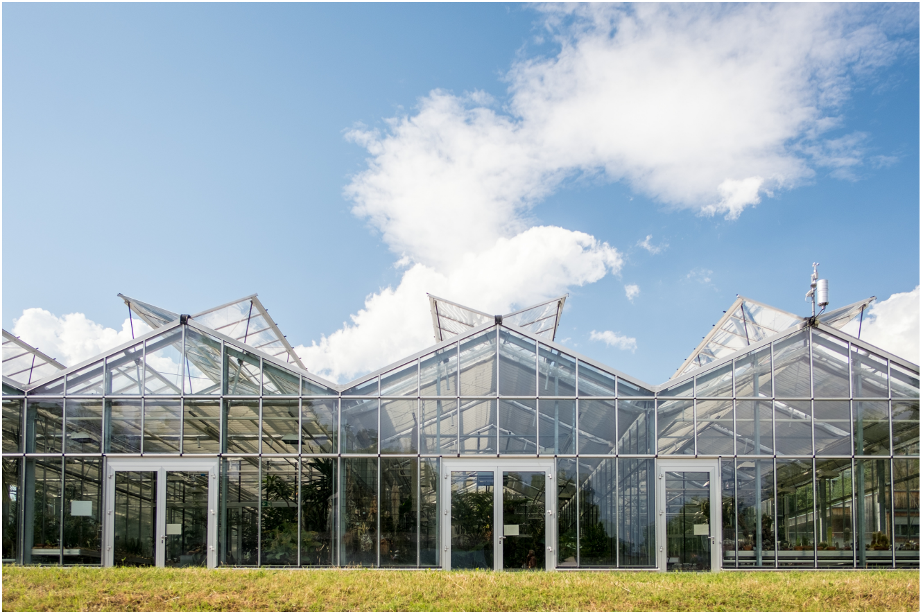
The medicinal hemp plants used by CANNABIS-NET can only be grown under strict conditions in the University of Hohenheim greenhouses.