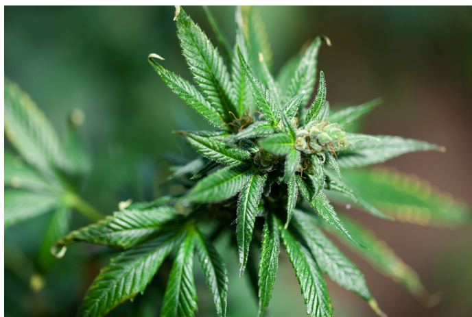
Cannabis sativa contains numerous valuable, medically effective ingredients.

Anyone who thinks hemp is just an inconspicuous plant, whose ingredients can be used, at best, as an intoxicant, can quickly be proven wrong. Besides being used as a valuable raw material for textiles and building materials, the plant has great potential as a medicinal drug. The CANNABIS-NET network, coordinated by the University of Hohenheim, has been set up to establish the basis for producing medicinal hemp in Germany.