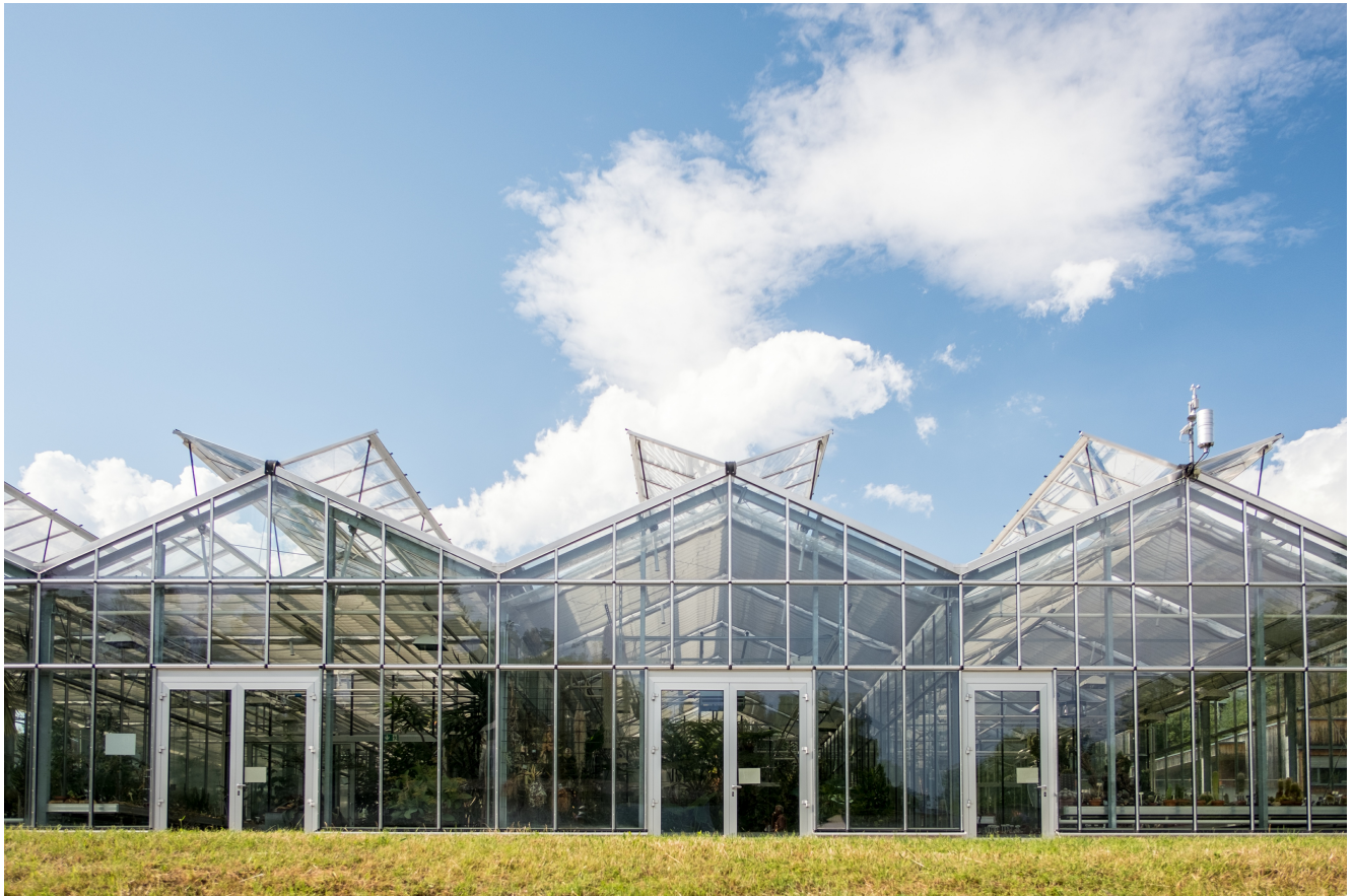
The medicinal hemp plants used by CANNABIS-NET can only be grown under strict conditions in the University of Hohenheim greenhouses.