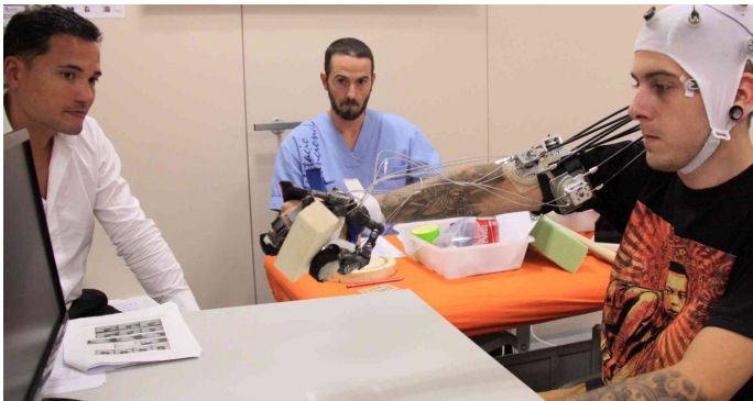
Patient testing a brain-computer interface developed at the Charité. It is used to control a hand exoskeleton.

Could people suddenly be able to move again decades after being paralysed? State-of-the-art quantum sensors integrated in exoskeletons could make this possible. Technology being developed as part of the BMBF-funded NeuroQ beacon project by researchers from organisations including the Fraunhofer IAF, the Charité in Berlin and the University of Stuttgart might achieve even more: besides facilitating movement, it could also – in the ideal case scenario – help cure paralysis.