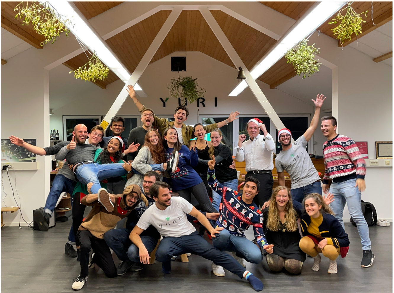
The yuri GmbH team at the Meckenbeuren headquarters

Before an experiment finds its way into the science box to be sent into space, a few steps have to be carried out on the ground, as Kugel explains: "We carry out a feasibility analysis with the research teams where our previous findings with 3D tissue models can prove valuable for future experiments in drug screening, toxicity or the development of healthy tissue." To ensure that the preparation of the samples succeeds in the narrow time window available before the rocket launch, researchers practise the procedures under real conditions. The tricky part is that there must be no air bubbles trapped in the cell cultures or caused by sealing problems, otherwise the cells will die. On launch day, the experiments are placed in the boxes, installed in an ISS incubator, and will during the trip undergo automatic media changes and fixation according to a predefined schedule before they are stored at 4 °C until further analysis.