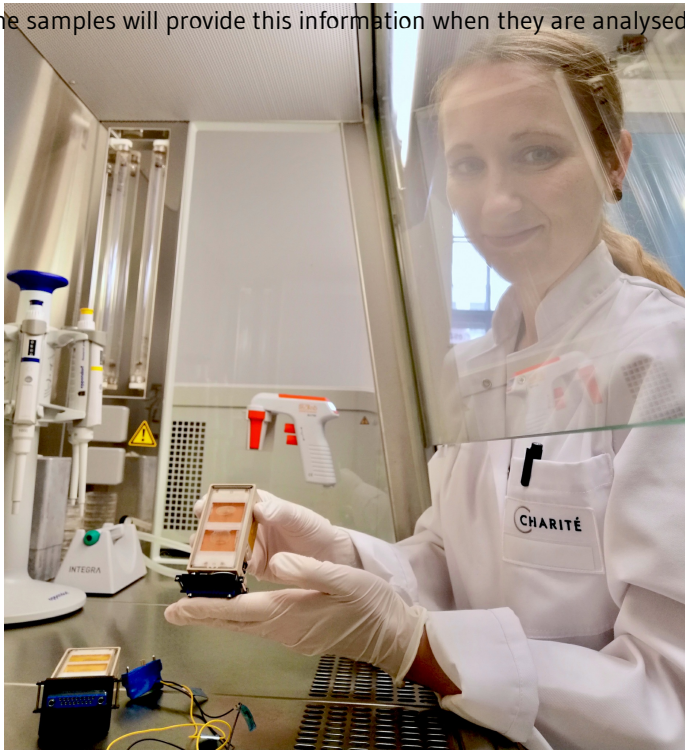
Scientist at the Charité with the cell culture research chambers. The cells in the chamber are supplied with nutrient solution by an integrated pump and attached tanks.

The samples will provide this information when they are analysed