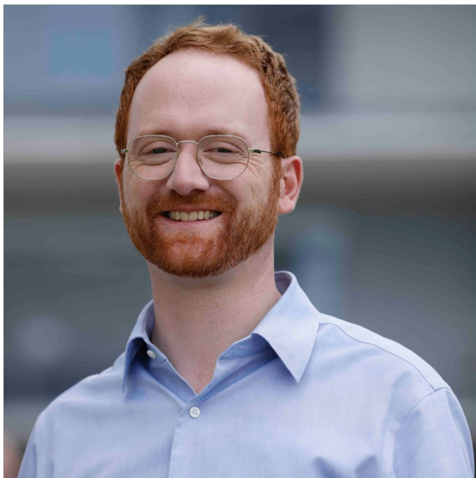
Prof. Dr. Justus Marquetand is a neuroscientist, neurologist, and research group leader at the Universities of Tübingen and Stuttgart. © Marquetand

The velocity at which these weak signals are conducted along muscle fibres – known as muscle fibre conduction velocity (MFCV) – is an important diagnostic parameter. Reduced MFCV might be a sign of muscle fatigue, muscle loss or nerve damage. In addition, trained muscles conduct signals faster than untrained ones, so MFCV measurements can be used in a targeted way to track training progress and rehabilitation.